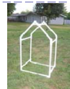
Dramatic Play House $45.00