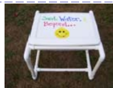
Sensory Stand & Tub $45.00