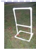
Flip Chart Holder $10.00