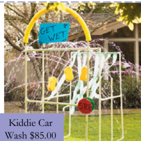
Kiddie Car Wash $85.00